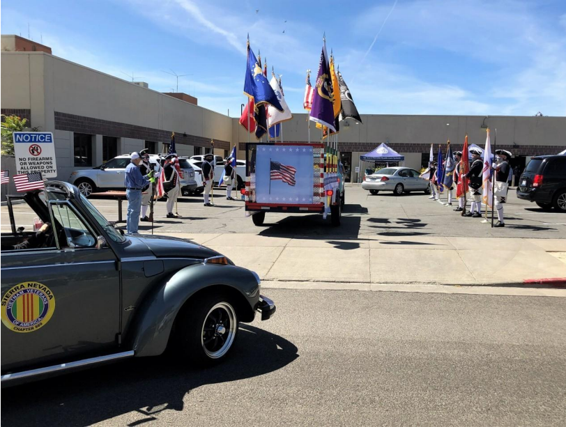
Battle Born Patriots Chapter, SAR positioned to receive the friends, families and supporters of hospitalized Veterans

Flag Day Salute to VA Hospital Veterans — June 14. The Covid-19 pandemic has impacted all our lives in ways we never imagined, but for veteran patients at the VA Hospital the effects are compounded by their isolation from contact with friends and family. At the invitation to the Office of Veterans Affairs we were invited to serve as the official Colorguard for a “Salute to Veterans.” For all of the veteran patients at the VA Hospital, this was their first contact with family and friends in months.