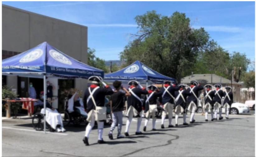
Battle Born Patriots + 1 Color guards' Salute To Veterans