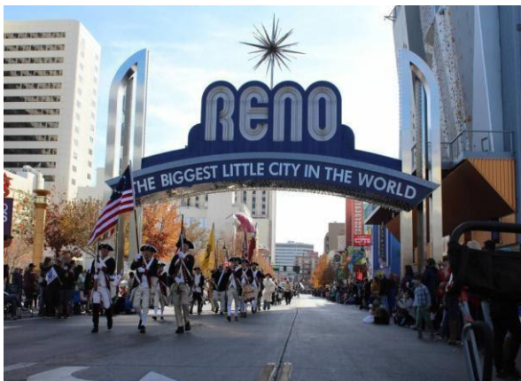
Figure 6-Reno Veterans Day Parade