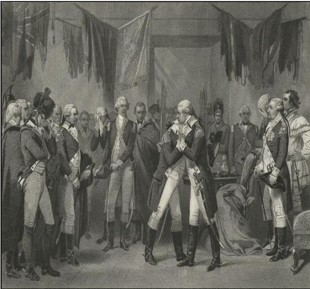
Washington's Farewell at Fraunce's Tavern

Every odd numbered month the lads get together for an evening that has grown from a just-for-fun evening into a much anticipated get together. The idea is based on the historical tradition that many of the ideas and events that lead to our independence were conceived and planned in America's taverns. The thought is, if it worked for our ancestors why not for us. BNO is intentionally convened with no agenda, but somehow plans are laid and decisions are made. One tradition that has proved valuable is the presentation of SAR Membership Certificates to new members. Below are a couple such presentations from 2022.