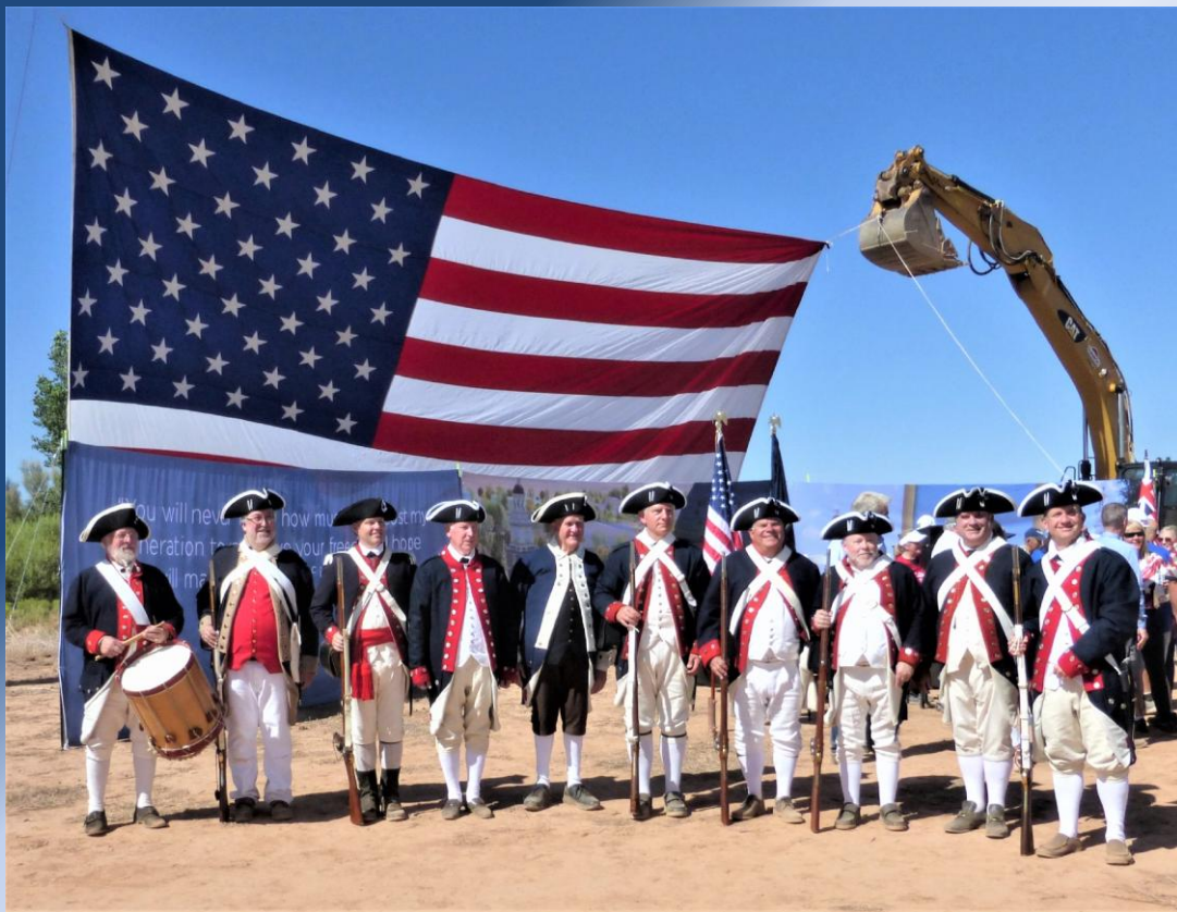
SAR Compatriots from Utah, Nevada and California

A combined color guard of UTSSAR, NVSSAR and CASSAR compatriots joined to present the colors at the United We Pledge's Tribute to Freedom concert and fireworks display at the Greater Zion Stadium, in St. George, Utah, on July 4th, 2022.